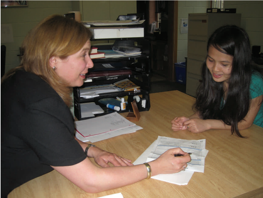
Opening a bank account