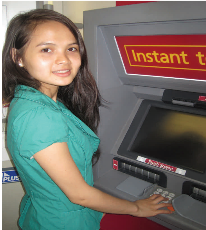
Transferring money from my savings account to my chequing account.